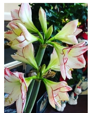
This is one Picasso bulb with two active blooming stalks. Each stalk has multiple blooms & more about to open.