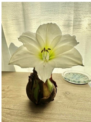
This bulb had a short first stalk. Following stalks were tall