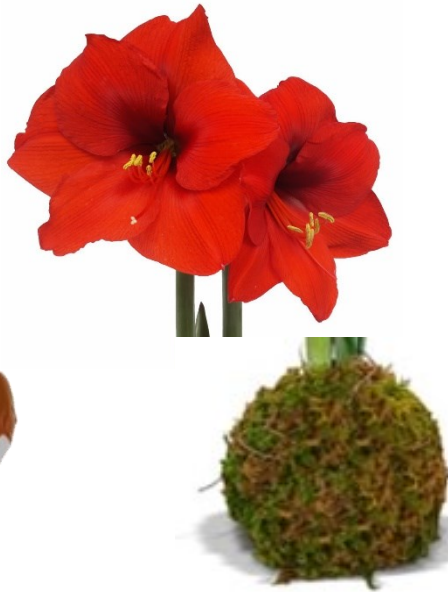
Bulb B: Blooms: Red Spanish Moss