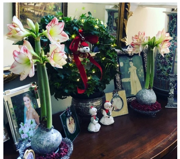
Picasso bulbs in Silver Splatter Wax. Multiple stalks per bulb; multiple blooms per stalk