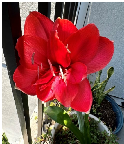
Christmas '22 bulb; planted in a pot and left on patio in hot Florida. Just leaves in '23, but beautiful blooms in May '24