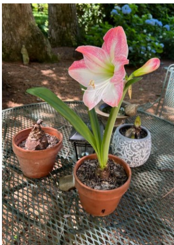
Christmas '22 bulb; planted in '23 after all stalks finished; blooming in pot late May '24