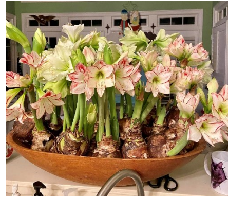
This picture was taken in Mid-December '23