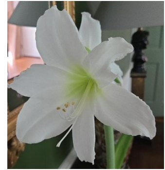
Bulb C: Blooms: White Spanish Moss