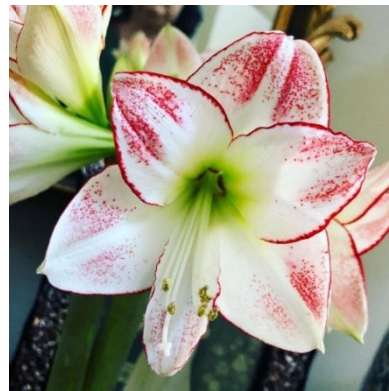
Bulb E: Blooms: White Wax: Silver