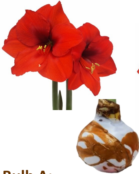
Bulb A: Blooms: Red Wax: White w/Gold Splatter