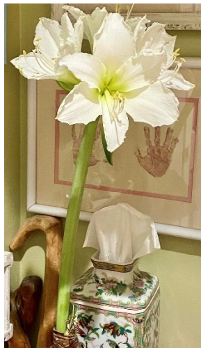
This is the bulb's 4th Stalk of blooms in Feb '24. (1 st bloom on 1 st stalk was in Dec '23)