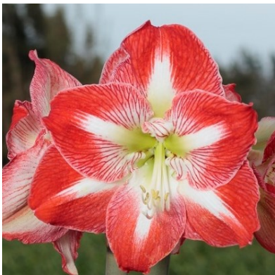
Bulb D: Blooms: Red & White Blooms Wax: Solid Red